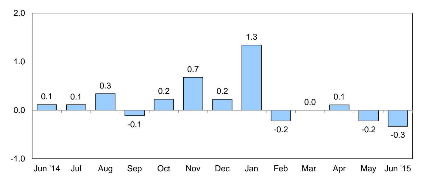
Chart 2: Over-the-month percentage change in real average hourly earnings for production and nonsupervisory employees, seasonally adjusted, June 2014 – June 2015

Real average weekly earnings decreased 0.2 percent over the month due to the decrease in real average hourly earnings and no change in the average workweek.